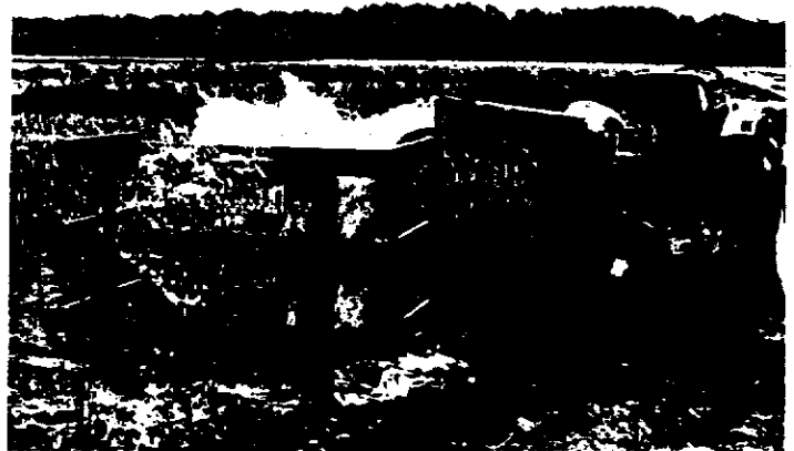
Figure 3. Recirculation and aeration are common practices for intensive crawfish production.