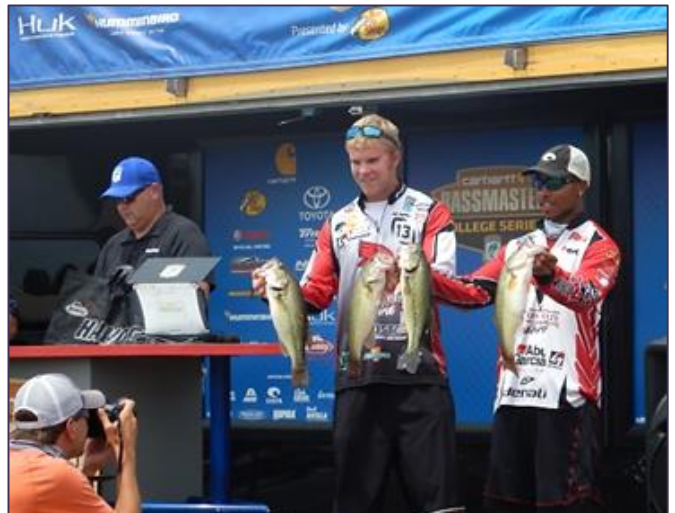
Illinois State University Bass Team competing at the 2016 Midwest Bassmaster Tournament at Clinton Lake.

The IHSA slogan for the bass tournament series, The Future Fishes Here, explains why high school competitive fishing is important to the Division of Fisheries. Division funding is tied to the sale of fishing licenses and taxes on fishing tackle. It is challenging in today's world to reach our youth and entice them to become lifelong anglers. The U.S. Fish and Wildlife Service conducts national hunter and angler surveys every 5 years and recently released the 2016 survey. It has been reported that increases in fishing license sales in parts of the country might be due to the popularity of youth bass tournaments. There have been no surveys or research to associate high school tournaments and license sales, but it is evident that youth tournaments are getting more kids involved in fishing.