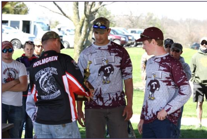
Trophy presentation for the 2018 Heart of Illinois Bass Tournament on Evergreen Lake.

Even if there are more than 2 anglers rotating in the boat during the day, each boat can only weigh up to 5 bass. All boats must be back at the designated boat ramp by the official ending time of the event, which is usually 3 p.m. The local tournament director will make sure each bass brought to the scale is of legal length and then the fish are weighed. The weight of each fish is combined for a total team weight and the winner is based on the highest overall weight. The top three schools in each sectional will qualify for the State tournament and a medal is awarded to the team with the largest bass of the tournament.