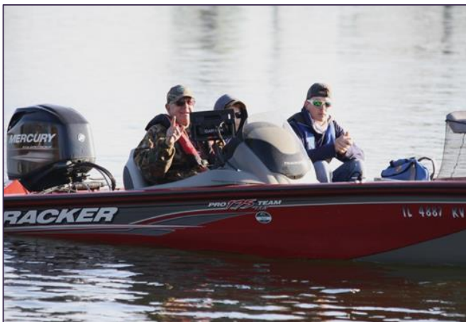
Boat 1 taking off for the start of the 2018 Lake Bloomington IHSA Sectional.

The two-day state final is held approximately two weeks after the sectional tournaments. Carlyle Lake has hosted the event all 10 years of the series. 60+ teams participate in the Illinois finals. The state champion team is determined by the overall weight after the two days.