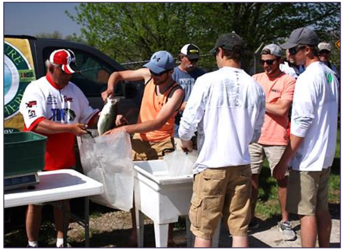
The winning team weighing in at the 2018 Lake Bloomington IHSA Sectional

There are state tournaments that are open only to youth anglers from within the state that compete for a state title while regional and national tournaments include high school anglers from multiple states. Larger interstate competitions can be televised and offer winners college scholarships and prizes as further incentive.