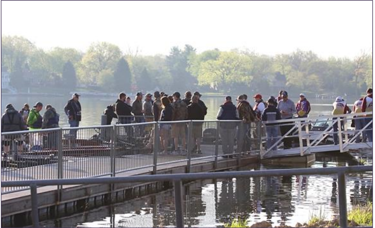
Anglers, boat captains, and coaches wait for the safety meeting to begin before an IHSA sectional bass tournament.

There is no doubt that tournament fishing is making fishing cool and has given us another avenue to reach our youth and get them fishing. In celebration, the Division of Fisheries will highlighted the past 10 years of the IHSA tournament series with a display at the Illinois State Fair. We hope to continue our efforts to increase awareness and get more youth fishing.