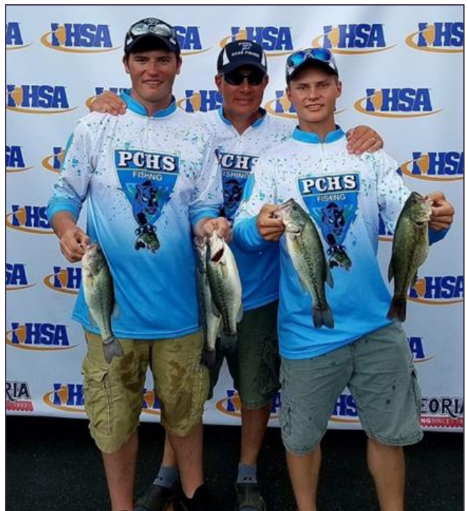
2018 IHSA State Bass Tournament Champions, Pinckneyville High School

The Division of Fisheries started tracking fishing tournaments in 2016. The subsequent data differentiates between youth and adult tournaments. In 2016, 79 youth bass tournaments were held in Illinois, which does not include the IHSA bass tournament series. In 2017, the number of youth bass tournaments increased to 94. So far in 2018, there are 115 youth bass competitions scheduled. In order to increase awareness and youth participation, the Division has created an online youth tournament calendar that invites event directors to post their tournament information.