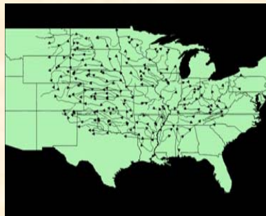
Figure 1. The Mississippi River Basin divided in 213 segments of 270 km each representing the maximum annual movement of an Asian Carp as calculated from average daily movements. These segments (delineated by black arrows) were used by the dispersal model to show changes in Carp density as simulated populations expand.

To calculate changes in Asian Carp numbers for all 213 river segments over thirty years (or more for calculations of future densities), a matrix for each scenario was created whereby the above equation was calculated for each segment over time. Lambda can be modified as new information becomes available.